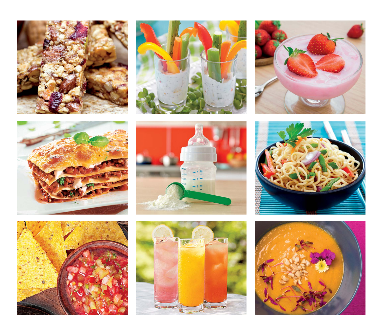
About Ingredion Ingredion Incorporated provides the world with ingredients that make everyday products better. We turn grains, fruits, vegetables and other plant materials into ingredients that make yogurt creamy, candy sweet, crackers crispy, paper strong and nutrition bars high in fiber. We serve more than 60 diverse sectors in the food, beverage, paper and corrugating, brewing and other industries. Headquartered outside of Chicago, Illinois, Ingredion employs approximately 11,000 people worldwide and operates global manufacturing, R&D and sales offices that serve customers in more than 100 countries.